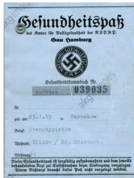
Nazi Health Pass

An aspect of Nazi propaganda was to label Jewish people as disease carriers, racial impurity was a public health issue.